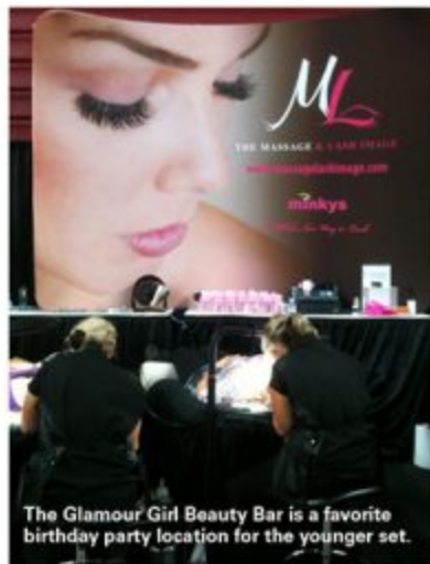
The Glamour Girl Beauty Bar is a favorite birthday party location for the younger set.

As business partners for their salon, The Massage & Lash Image, and best friends, they have found a formula for working as a unit and finding time for busy family lives.